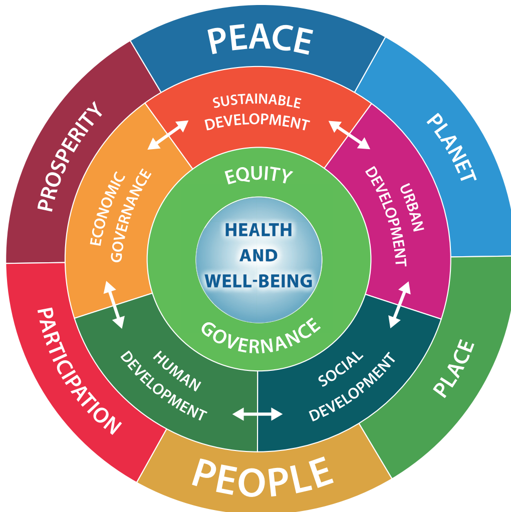
Fig. 1. WHO European Healthy Cities Network Copenhagen Consensus of Mayors: healthier and happier cities for all