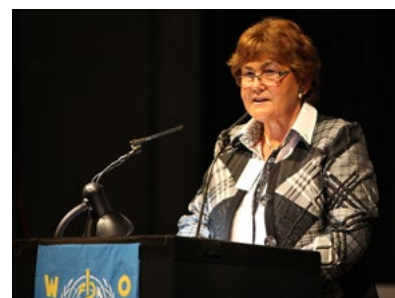
Zsuzsanna Jakab WHO Regional Director for Europe

I believe Health 2020 can add significant value to all of our individual and collective work to enhance health and well-being, serve as unique resource to enhance the future and prosperity of individual countries and the Region as a whole and benefit all its peoples. Actively informing and aligning our daily practice with Health 2020 values and approaches will enable us to build a healthier Europe for ourselves and our children.