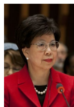
Margaret Chan WHO Director-General

The framework for Europe is closely aligned to WHO's Twelfth General Programme of Work and is a practical expression of a programme of reform in WHO that seeks to enable the Organization to respond to Member State needs more effectively in a rapidly changing world. In the European Region, as in other regions, the outcomes envisaged in this policy framework require that international organizations be able to work not just with selected sectoral ministries but across all relevant parts of government; with colleagues in other international organizations that influence health; as well as with industry, academe and civil society. The policy framework for Europe signals the way forward for new approaches to health and well-being worldwide.