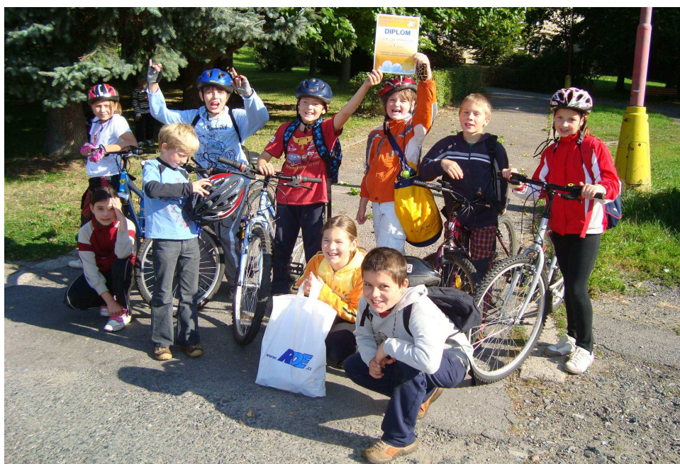
The conclusion of European Mobility Week Campaign in the Healthy City of Hlinsko