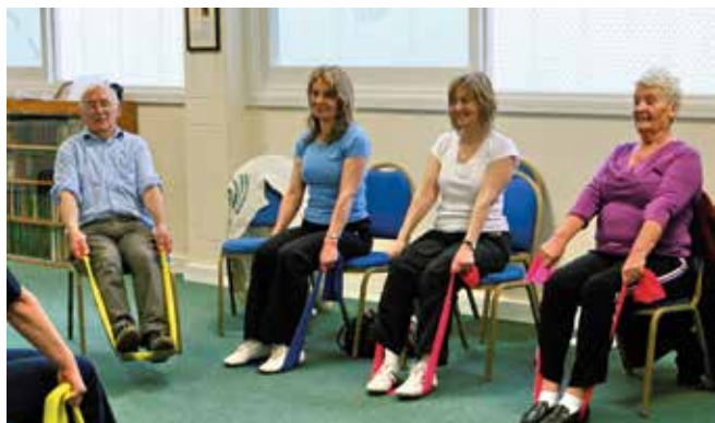
Age Cymru LIFT Programme

The Welsh Government Strategy for Older People in Wales 2003-23 promotes and develops older people's health and well-being, their capacity to continue to work and learn and provides high quality services and support. It addresses the social, economic and environmental factors that influence health (the wider determinants of health) including income, housing, and life-long learning as well as health improvement and healthcare.