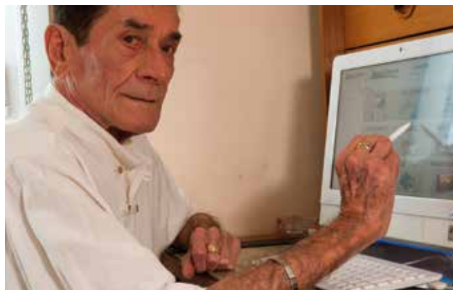
Direction de la Communication CG Bas-Rhin / mars 2013 / Photos : Denis Guichot/CG67

In 2010 the Council launched a call for projects. Seven innovation projects were selected and tested over the period 2010-2012, with an overall budget of €2.6 million. Two projects received additional funding from the European Agricultural Fund for Rural Development. The Council and its partners have developed an expertise on